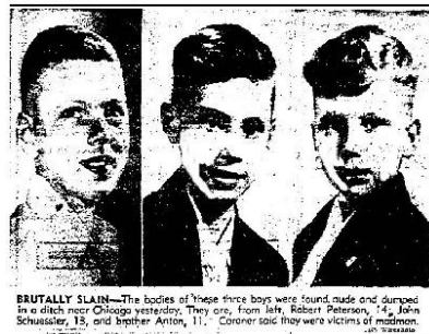
Newspaper clipping from the time.