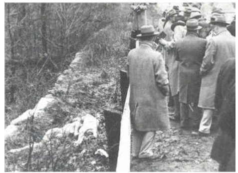
At least one of the girls had ice pick-like punctures, both had been frozen to death and dumped naked next to a road. The older one also may have been raped.

The two little girls have been described as being sadistically tortured, repeatedly punctured with a sharp pointed object like an ice pick, or leather owl in the upper torso, thighs and buttocks. This may have been part of the blood collecting process.